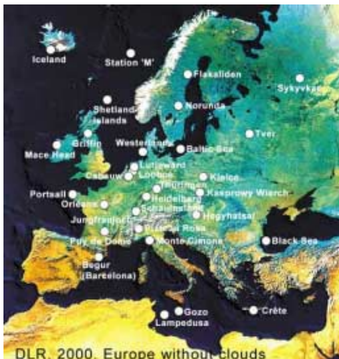
Figure 1: Ground level monitoring stations of the network of atmospheric CO 2 and related tracer measurements within AEROCARB.

AEROCARB, which is a EU-funded project of the CARBOEUROPE cluster, involves 13 institutions in 8 European countries. The prime objective is to estimate and monitor the net European carbon balance on monthly to decadal time scales, as a means to corroborate EU-wide controls of CO 2 emissions. Closely connected to this is the study of spatial and temporal variations of the CO 2 sources and sinks over the European continent. The project is based on a synergy of atmospheric measurements, mesoscale atmospheric transport models, surface emission data, and diagnostic models of land ecosystems carbon exchange. The unified European network of atmospheric CO 2 and related tracers concentration measurements consists of ground level monitoring stations (Figure 1) and a transect of regular biweekly aircraft CO 2 soundings between the Atlantic and Eastern Europe.