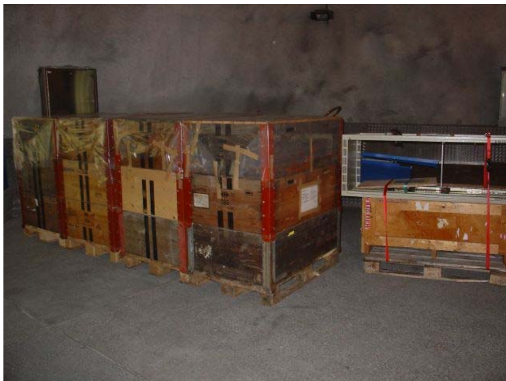
February: CLACE 6 (CLOUD and Aerosol Characterization Experiment) at Jungfraujoch. Crates of equipment from one of the research groups.