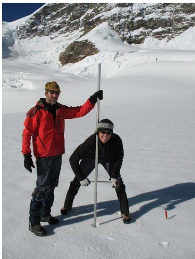
December: Mass balance measurements on Jungfraufirn using a firn-drill to determine the density in the annual layer.