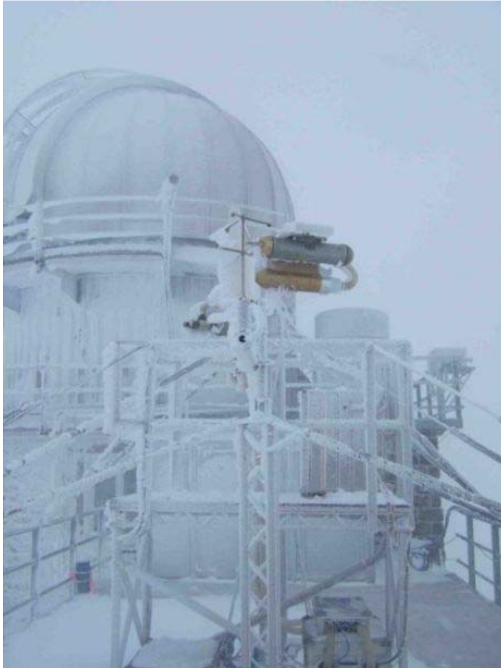
March: CLACE 6 (CLoud and Aerosol Characterization Experiment) at Jungfraujoch. Cloud Particle Imager (CPI) and Forward Scattering Spectrometer Probe (FSSP) firmly installed on the Sphinx platform to withstand a snowstorm.