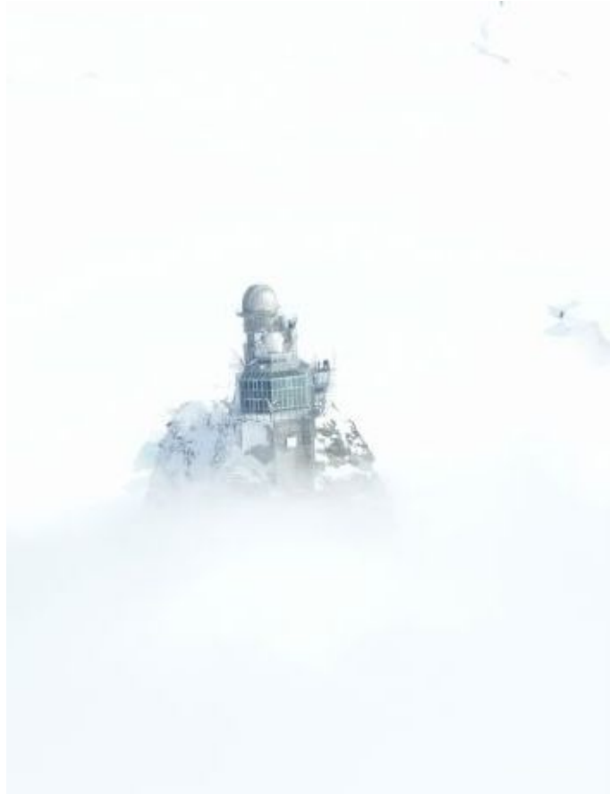
April: The Sphinx coming into view through the clouds.