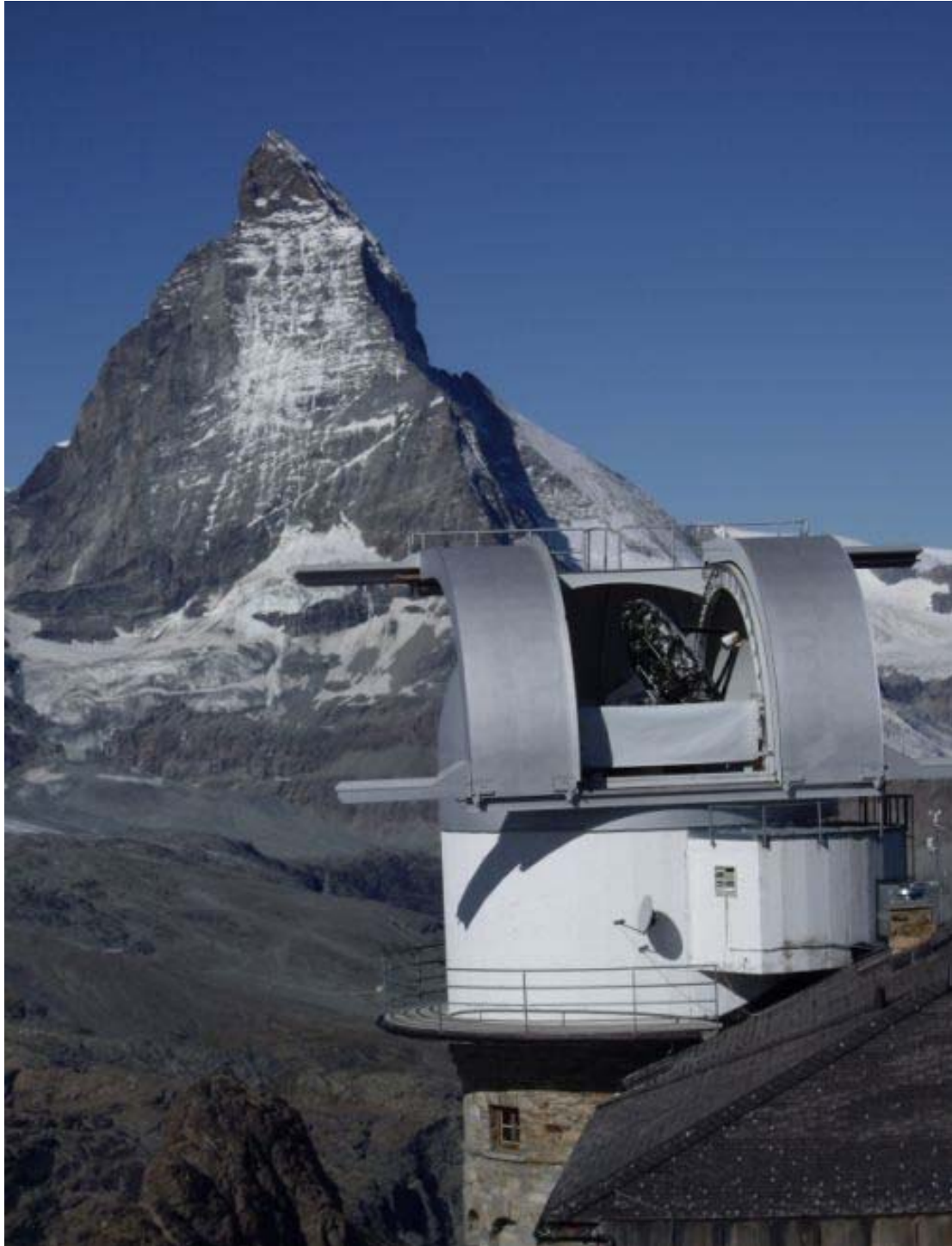
October: Observatory Gornergrat South with the KOSMA radiotelescope of the Universität zu Köln at Kulmhotel Gornergrat. This year marks the 100th anniversary of the Kulmhotel Gornergrat.