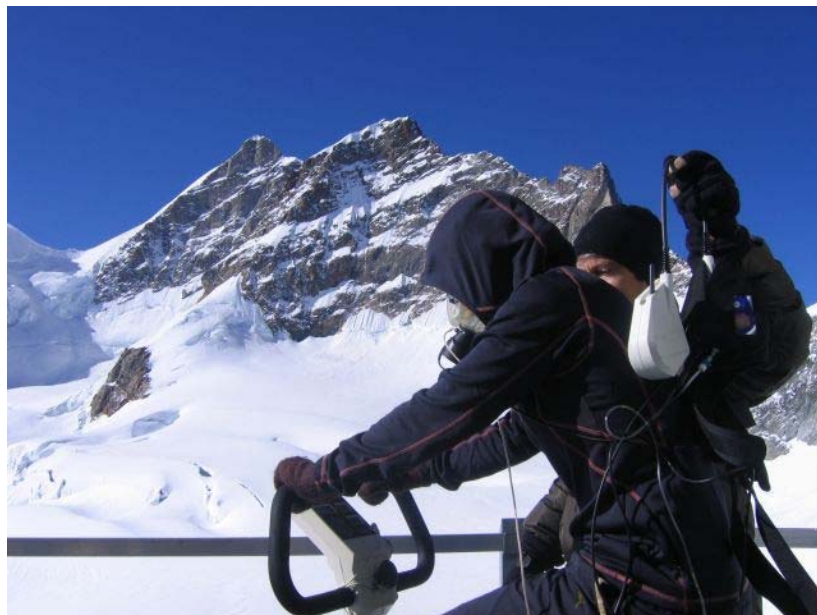
November: Snapshot from a medical experiment carried out in October by the Centre Hospitalier Universitaire Vaudois CHUV Lausanne and the University Hospital, Berne, at the research station Jungfraujoch.