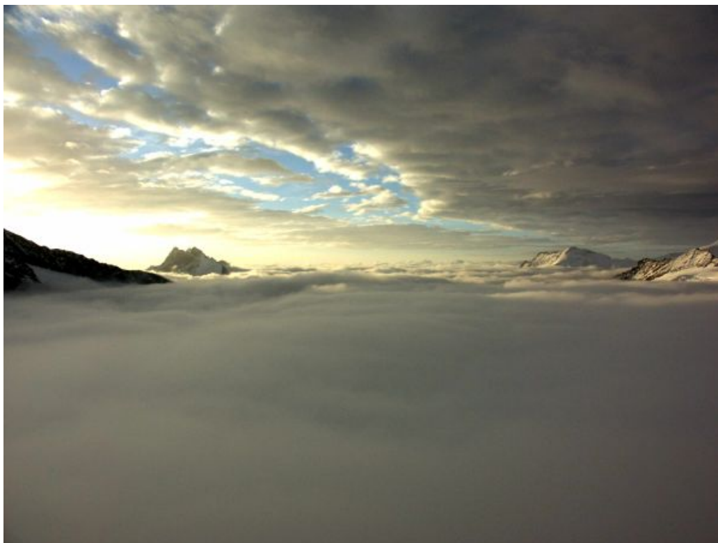
January: The best view of the fog is from the top of Europe.