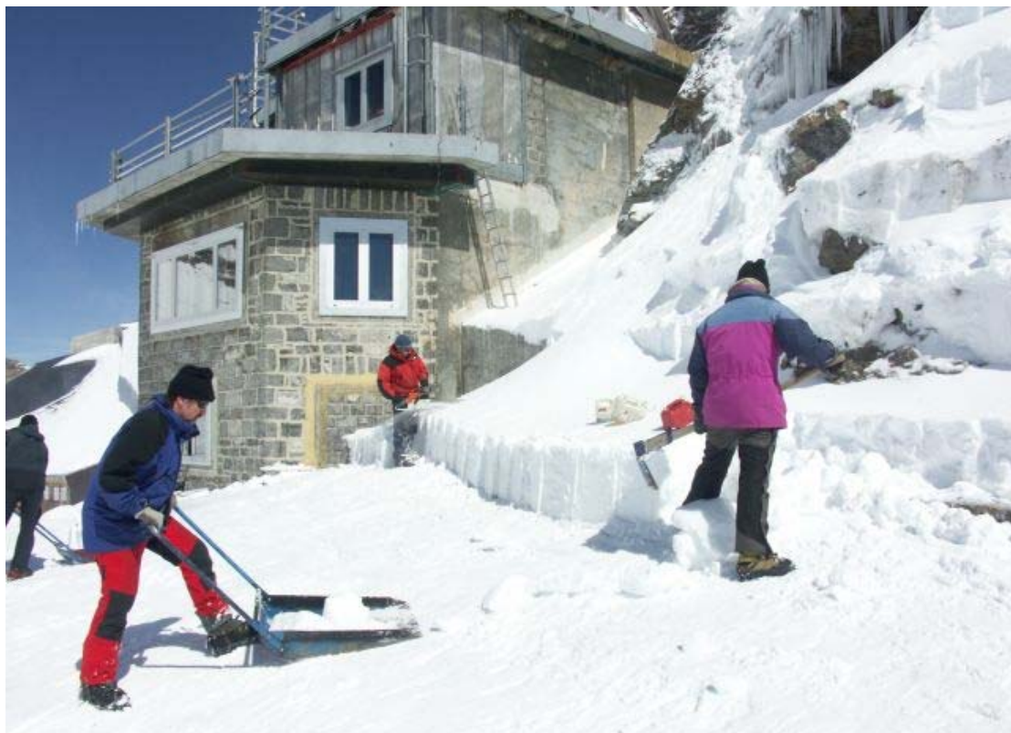
July: The annual snow removal work at the Research Station Jungfrauoch by a team of mountain guides.