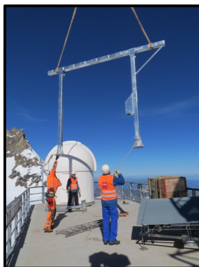
Figure 2. New bridge arrival