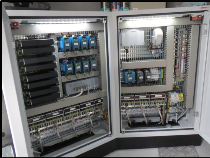
Figure 4: New acquisition for the instruments solar tracker