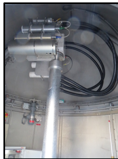
Figure 3: Solar tracker