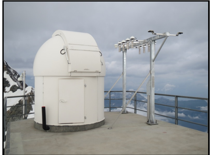
Figure 5: Jungfrauoch station - final state

Scientific publications and public outreach 2015: